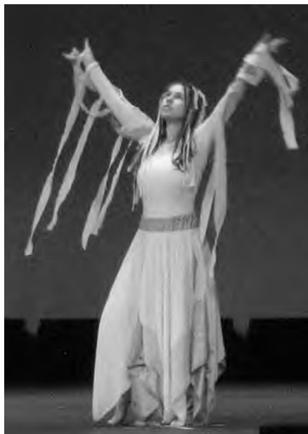
The Artifact—Masquerade Entry